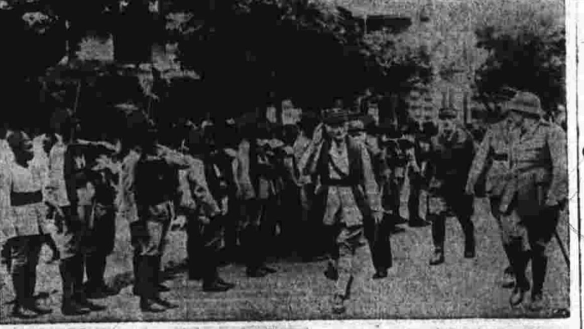
Gen. Maxime Weygand, French government delegate for Africa, salutes a detachment of Senegalese sharpshooters after leaving the governor's palace in the West African port of Dakar, Senegal. More recently, Weygand appeared by radio to the 500,000 men under his command in North Africa to ignore the urging of Gen. Charles de Gaulle, leader of the "Free French" forces, who has appealed to them to join the British assault on Italian Libya.